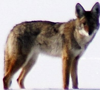
Local female coyote on frozen Baert Lake- 2013 - Will call her "BIRDIE".

Phone: (541) 576-2216 • Fax: (541) 576-2272 • Email: cvparkrec@yahoo.com • www.cvparkandrec.org • Open Monday-Thursday 10 am - 2 pm