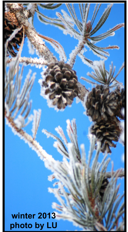
winter 2013

Visit the United Prevention/Intervention Coalition Facebook page or Lake County Prevention's website at www.lakecounty.org/government/prevention for more information.