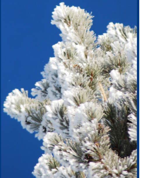
winter 2013