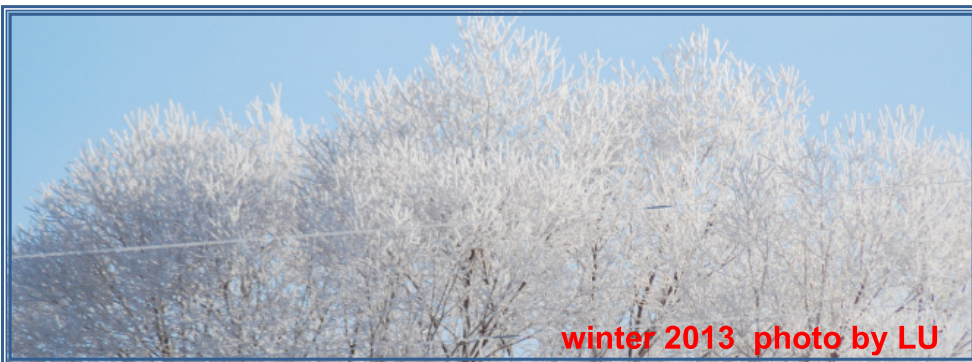
winter 2013

Or visit us at: www.mtmazamaspringwater.com