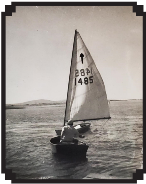
~ Baert Lake - 1964 ~