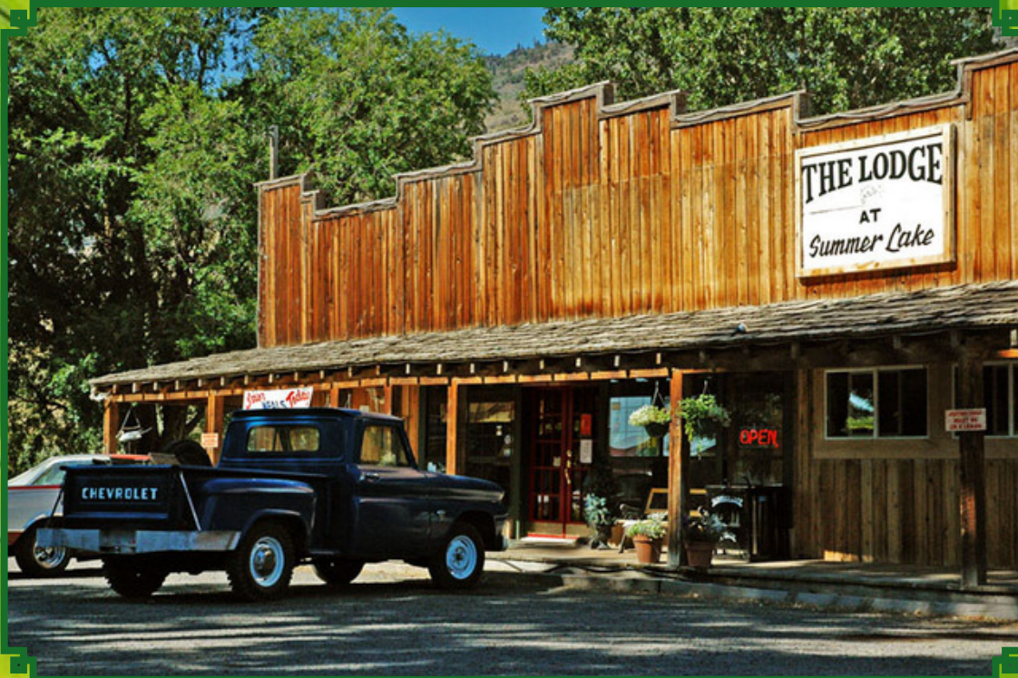
The Lodge at Summer Lake Summer Lake, Oregon

Phone: 541-576-2216 Fax: 541-576-2272 desertwhispers@yahoo.com